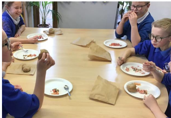
Cooking - yum!