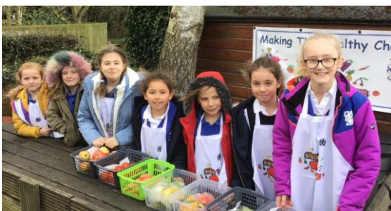
Taking on new responsibilities